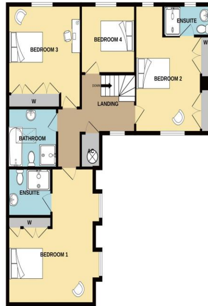
TOTAL FLOOR AREA : 2029 sq.ft. (188.5 sq.m.) approx.

Whilst every attempt has been made to ensure the accuracy of the floorplan contained here, measurements of doors, windows, rooms and any other items are approximate and no responsibility is taken for any error, omission or mis-statement. This plan is for illustrative purposes only and should be used as such by any prospective purchaser. The services, systems and appliances shown have not been tested and no guarantee